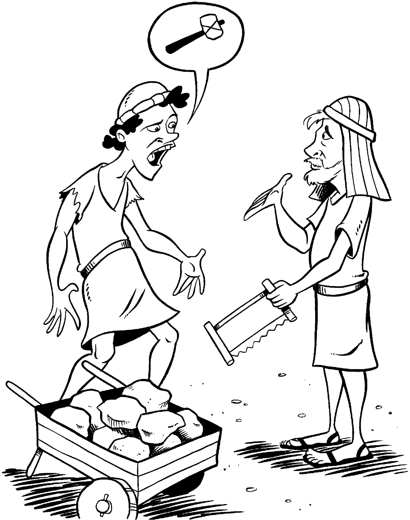
God confused the language of the people of the earth (Gen. 11:7).