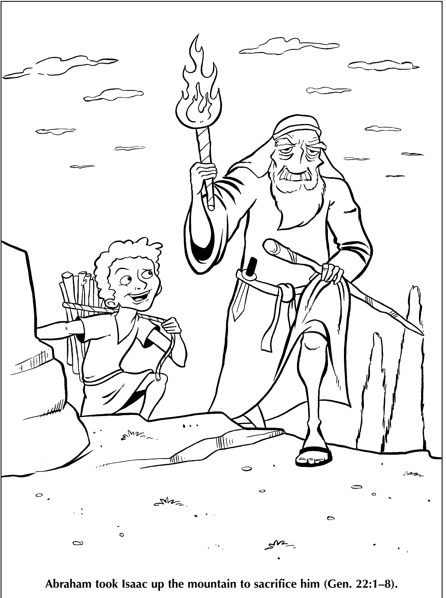
Abraham took Isaac up the mountain to sacrifice him (Gen. 22:1-8).