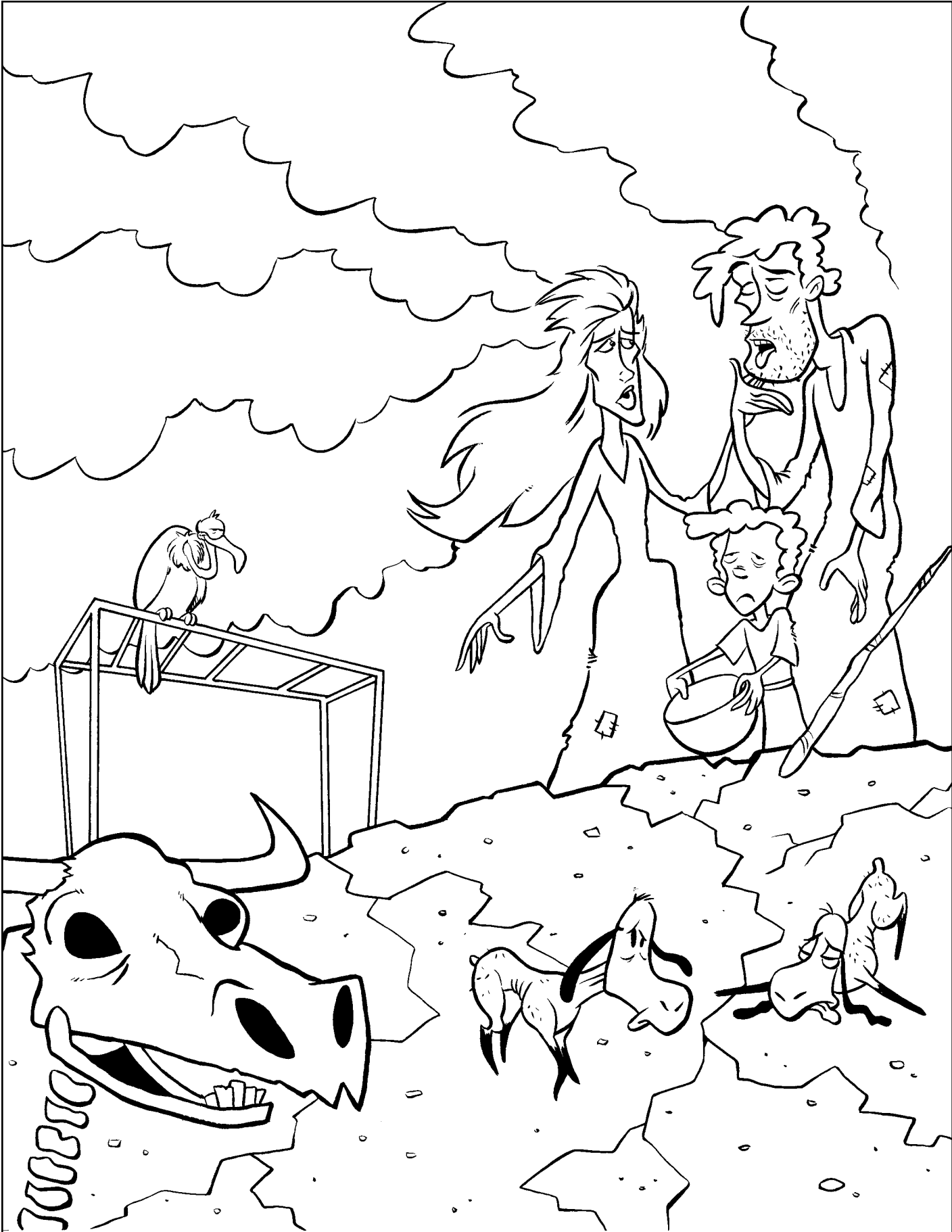
God promised to curse Israel if they disobeyed His commands (Deuteronomy 28).