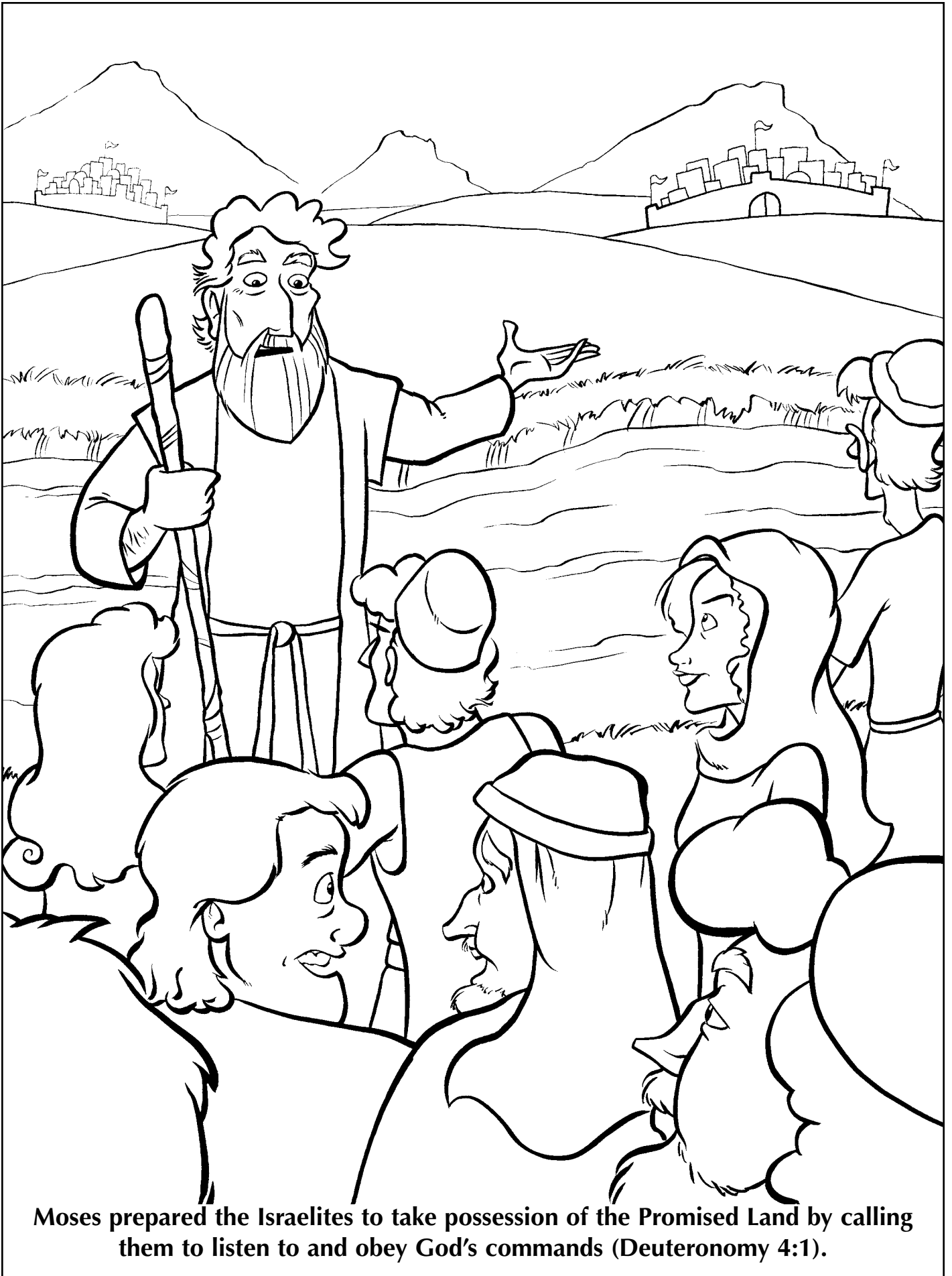
Moses prepared the Israelites to take possession of the Promised Land by calling them to listen to and obey God's commands (Deuteronomy 4:1).