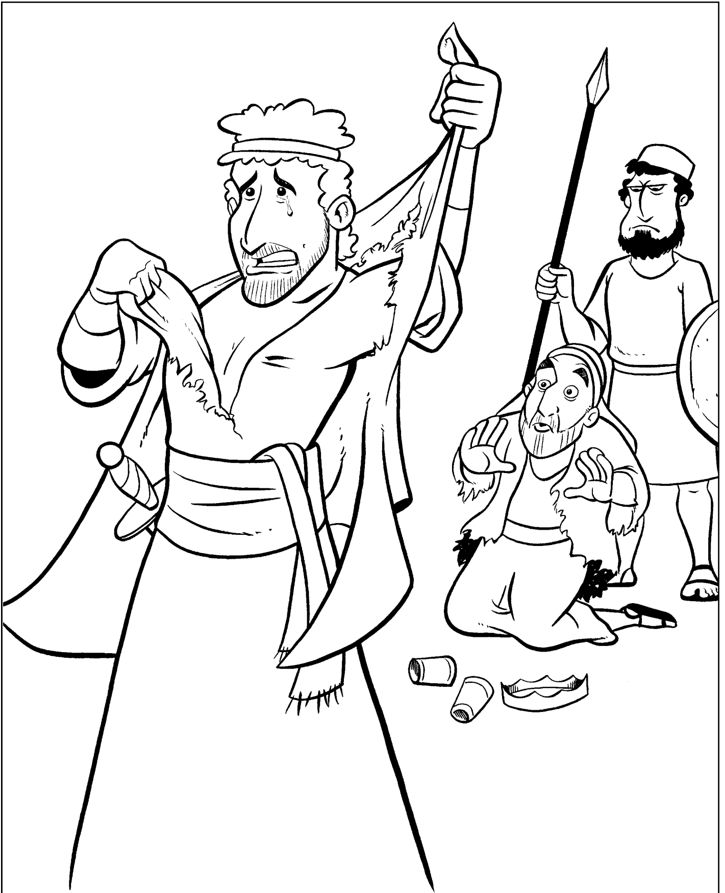
David expressed great sorrow when he heard that Jonathan and Saul were dead (2 Sam. 2:1–15).