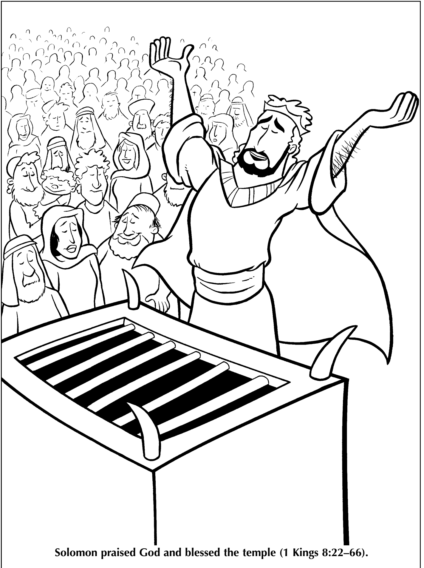
Solomon praised God and blessed the temple (1 Kings 8:22–66).