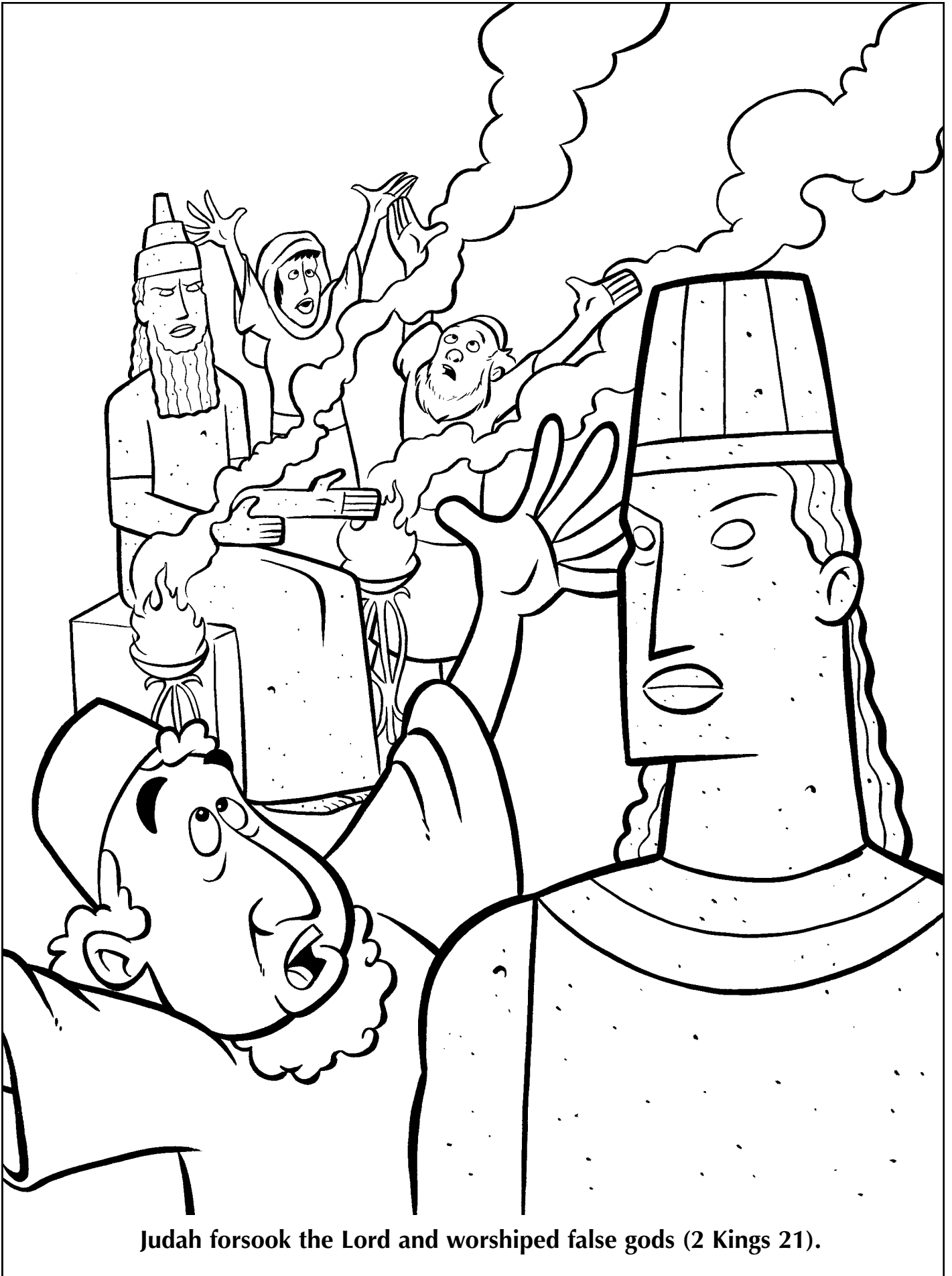
Judah forsook the Lord and worshiped false gods (2 Kings 21).