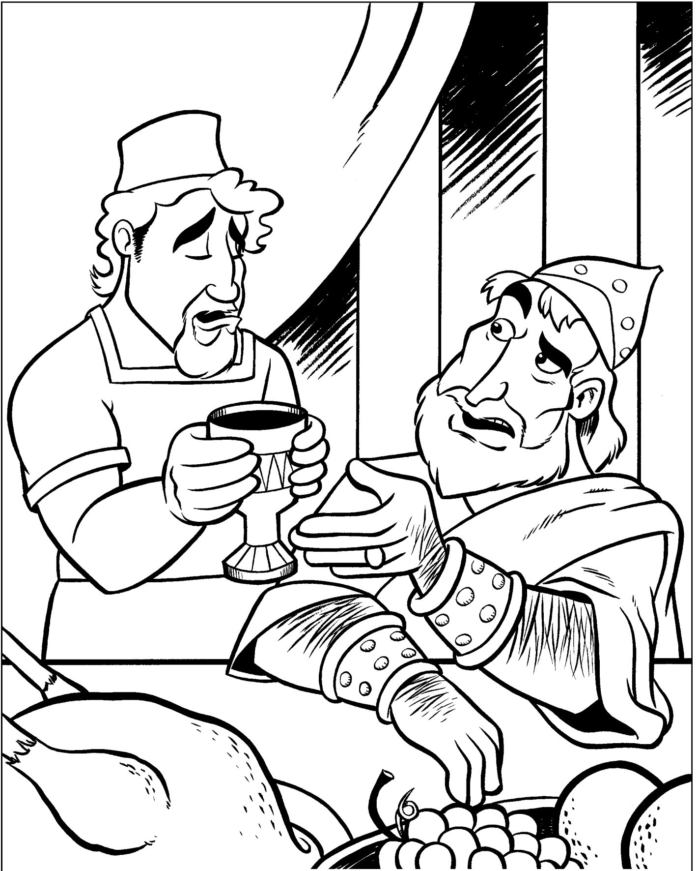
Nehemiah asked the king for permission to rebuild Jerusalem's wall (Neh. 2:5).