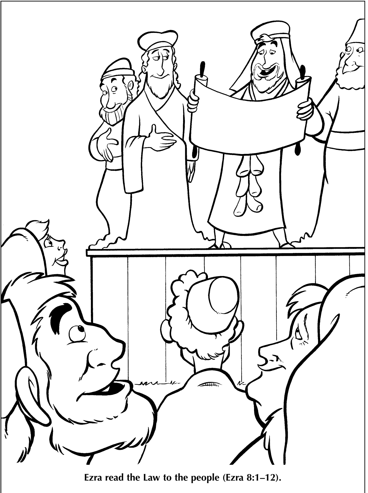
Ezra read the Law to the people (Ezra 8:1-12).